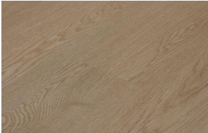
Larimer 4.5 45588

Main Street 4.5 offers the ultimate in design flexibility, comfort underfoot, ease of installation or repair, and is acoustically superior as compared to typical luxury vinyl. Eliminates the need for transitions to other floors of similar height, and is extremely stable, making it very wheelchair friendly. Main Street 4.5 is suitable for residential or heavy-duty commercial applications.