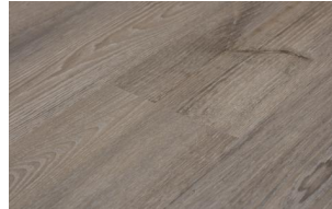
Broadway 4.5 45583