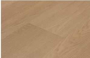
Rainey 4.5 45587