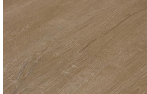
Zilker 4.5 45586