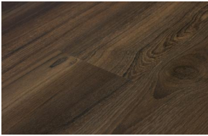
Robson 2 45597