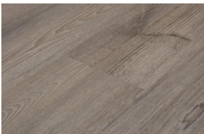
Broadway 2 45595