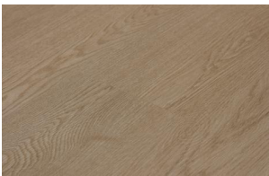
Larimer 2 45600

Main Street 2 offers design flexibility in a budget-friendly glue-down option and is suitable for residential and light commercial applications.