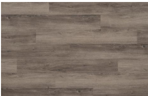
Tee Box 45679